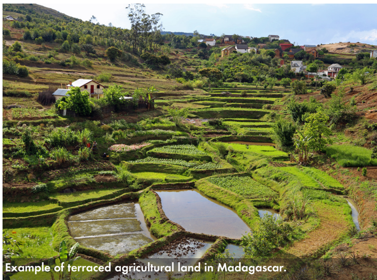
Example of terraced agricultural land in Madagascar.