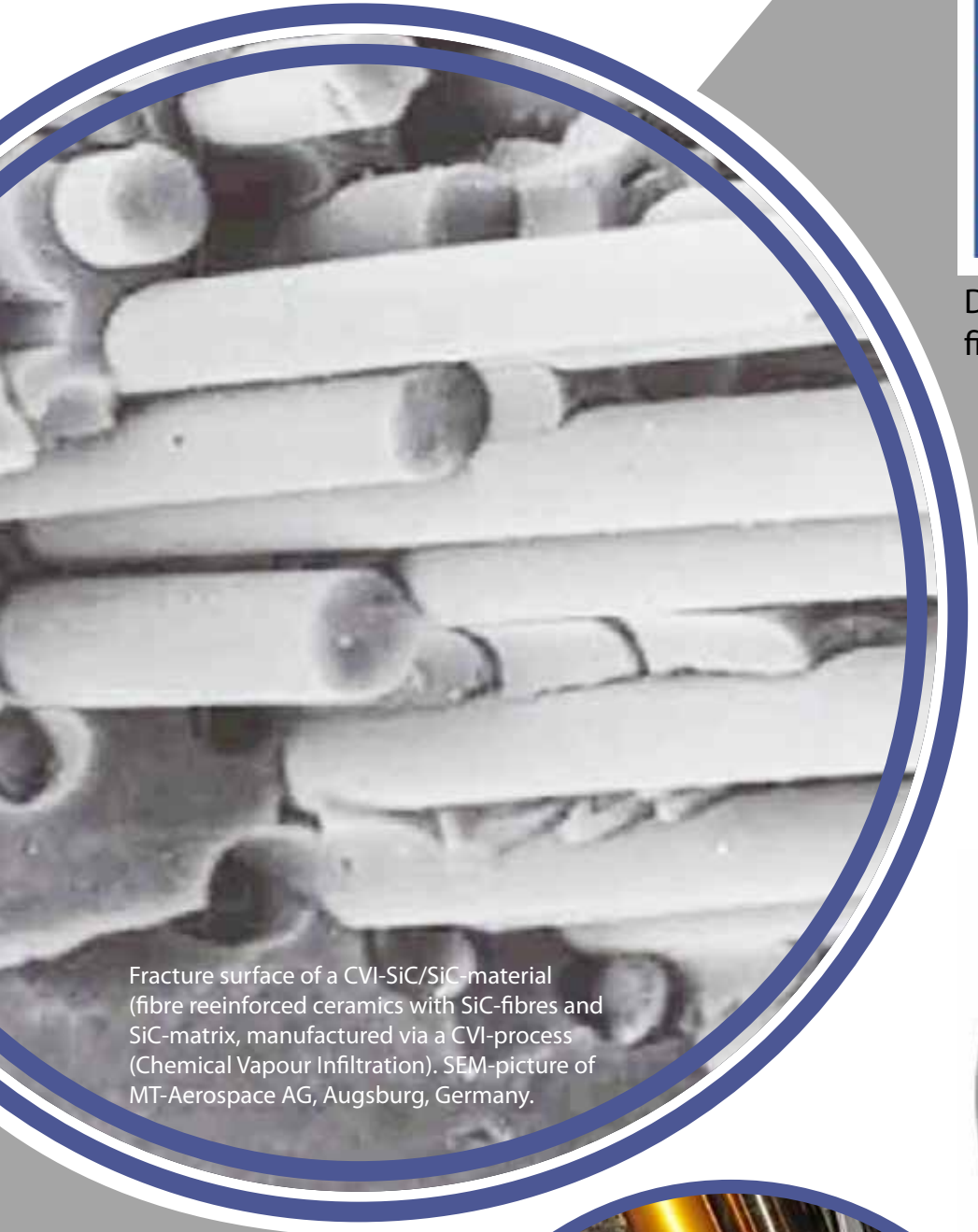
Fracture surface of a CVI-SiC/SiC-material (fibre reinforced ceramics with SiC-fibres and SiC-matrix, manufactured via a CVI-process (Chemical Vapour Infiltration).

CMCs are also used in brake disks for luxury cars and motorcycles. One common material used is carbon fibers in a carbon matrix.