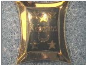
Plain Badge $91.20 in 10K gold, $23.75 in gold clad

Engraving is available (initials, chapter, letters, date) for all items at an additional cost of $4.00