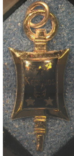
Key $120.20 in 10K gold, $37.80 in gold clad