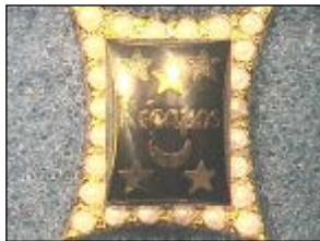
Crown Pearl Badge $160.30 in 10K gold, $93.85 in gold clad