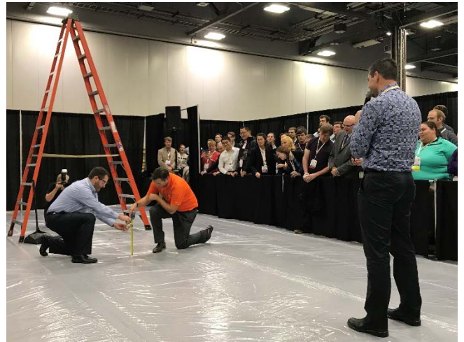
Mug Drop Competition