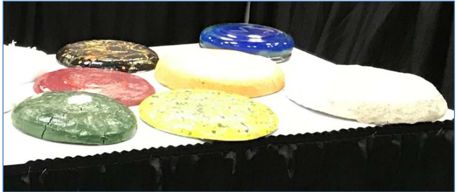
Ceramic Discs from the Chapters