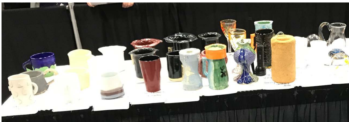
Ceramic Mugs from the Chapters