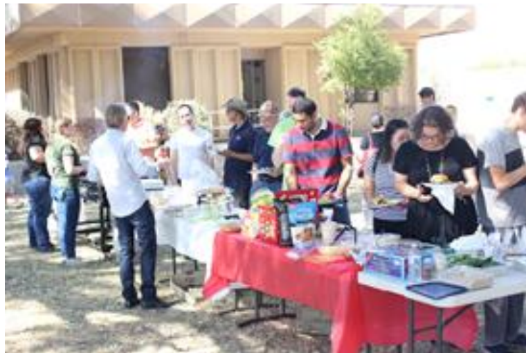
(Departmental BBQ hosted by Keramos and MA)