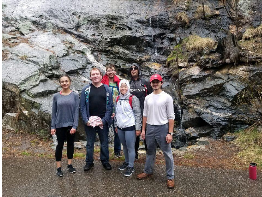
(Keramos members after hiking Mt. Lemmon on a rainy day)

Social events have been organized this year to facilitate an environment for students to get to know each other in a non-academic setting. Events include going to the local corn maze during Halloween, arcade night at an arcade establishment in downtown Tucson, Dinner and Bowling, and a hike on Mt. Lemmon.