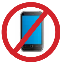
Cell phones silent

During oral sessions conducted during Society meetings, unauthorized photography, videotaping, and audio recording is strictly prohibited for two reasons: