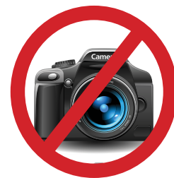
No photography/ recording

Note: The Society may engage photographers to photograph sessions for marketing and promotional purposes.