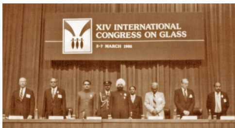
Figure 8: 14 th ICG Congress in New Delhi, 1986 – opening session

The next congress was held in 1986 in another Asian country – in New Delhi, India. The festive character of the opening ceremony at the congress was supported by a speech given by the Indian president, Mr. Giani Zail Singh. Despite the long distance from Europe and USA, the excellent professional standard of the congress was ensured through 177 lectures, 87 posters and 650 glass experts from all over the world.