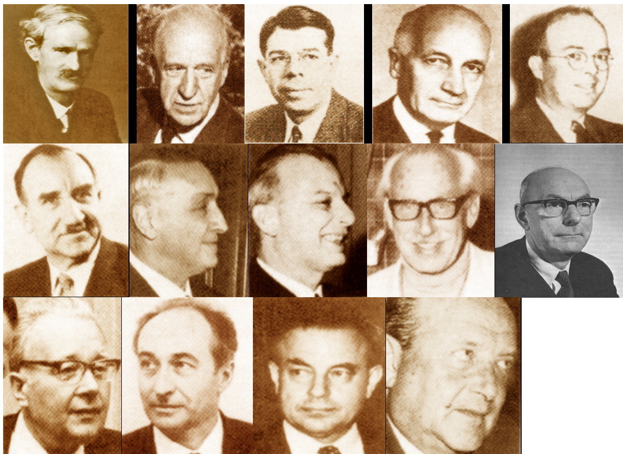
Figure 5: ICG presidents in 1933 - 1985

The International Congresses on Glass were always organized under the auspices of ICG. All its management bodies – Bureau, Executive Committee (later Steering Committee) and the ICG Council were involved in the preparation and post evaluation of the congresses. The elected ICG presidents were outstanding and respected personalities, and scientific authorities with international prestige; they contributed significantly to the implementation of the fundamental ideals of the ICG constitution and, last but not least, to the recognition of the high professional standard of the International Congresses on Glass (Figure 5).