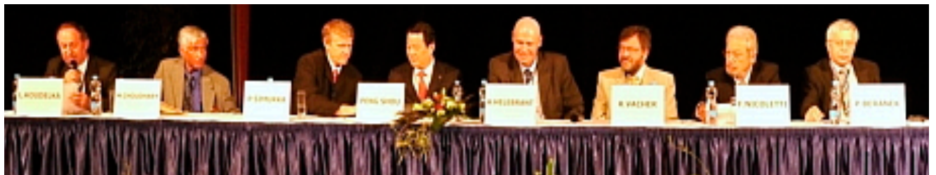
Figure 16: Opening ceremony - 23 rd International Congress on Glass , Prague