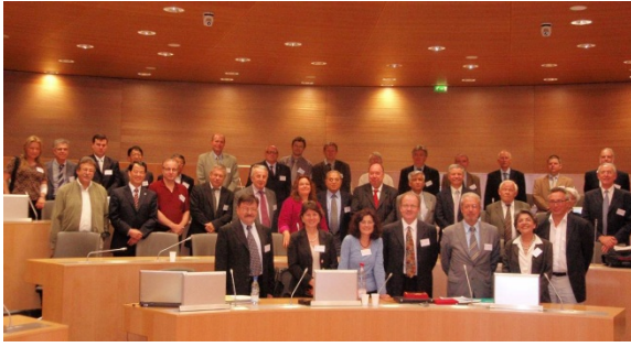
Figure 13: 21 st ICG congress in Strasbourg, 2007 - Council meeting

In 2010 the International Congress on Glass for the first time took place in South America, in Brazil (Salvador, Bahia). The remoteness of the venue affected the number of participants but not the professional standard of lectures and posters. The organizers and the president of the congress, Prof. Edgar Dutra Zanotto, succeeded in bringing in leading experts whose lectures documented the current status and the anticipated development in traditional and newly developing areas of glass science and technology. The topic of the round table discussion was highly relevant: “Glass, energy and environment“; it documented completed work and successfully inspired a continuation of preparations for a broader overview of the topic.