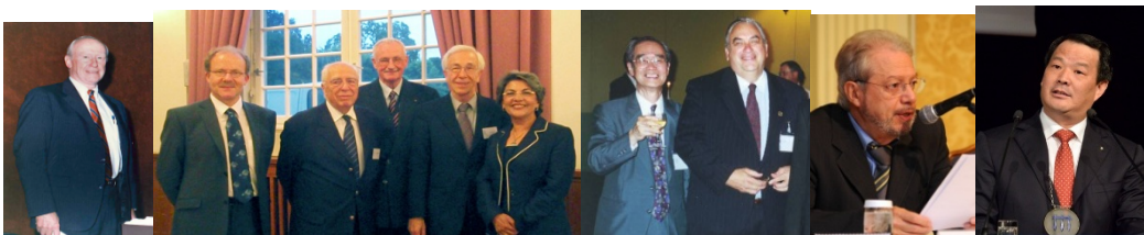
Figure 15: ICG presidents in 1985 - 2012