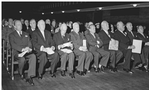
Figure 4: Opening ceremony of the 5 th ICG Congress in Munich, 1959

In 1959 the congress was held for the first time in Germany – in Munich. The importance ascribed to the event by the then government of West Germany was documented by the fact, that the congress was attended by Vice-Chancellor Erhard, who gave a lecture on current economic development. Despite the fact that some Asian and East European countries were only represented by small delegations, the congress proved that contacts between glass experts were again developing on a global scale.