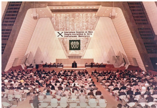
Figure 6: 10 th ICG Congress in Kyoto, 1974 - opening ceremony

Japan was the first among the Asian countries. The 10 th International Congress on Glass was held in Kyoto in 1974. This event confirmed that the concept of International Congresses on Glass and the international cooperation within the International Commission on Glass had also become established on the Asian continent. The professional agenda of the congress was extended with an accompanying meeting that documented progress in the then very topical field of optic fibers and waveguides.