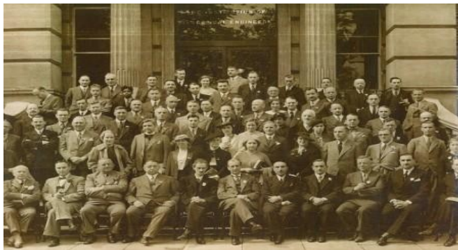
Figure 2: 2 nd ICG Congress in London-Sheffield, 1936