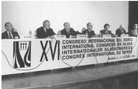
Figure 9: 16 th Congress in Madrid, 1992 – opening session

cooperation of glass professionals at the national level and ensuring financial security for the activities of their national organizations, started to develop their international contacts even more intensely. The first congress held after the political changes at the turn of the 1980s and 1990s was the 16 th International Congress on Glass in Madrid, Spain, in 1992. Preparation of the professional agenda was for the first time managed by a Scientific Committee whose members were outstanding experts representing the world's glass community and who selected contributions that guaranteed a high standard for all sessions.