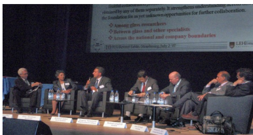
Figure 25: 21 st ICG Congress in Strasbourg, 2007, round table

In recent years panel discussions and round tables have found a firm place at the ICG congresses. They address topical issues of glass technology and glass production in a broader context of the worldwide developments. These new forms of communication have substantially enriched the program of ICG congresses and have become very popular with their participants.