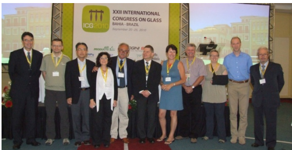
Figure 23: Winners of ICG V. Gottardi Prize ( 22 nd ICG Congress in Bahia, 2010)