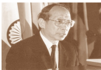
Figure 10: Gan Fuxi – President of the 17 th Congress, Beijing 1995

In 1995 the organization of the international congress was for the first time entrusted to the Chinese Ceramic Society in celebration of the fiftieth anniversary of its founding. This congress for the first time in the ICG history granted the newly established ICG Presidents Award to three distinguished glass experts. The highest ICG award, it recognizes an extraordinary lifelong contribution to the development of glass science, technology or artistic processing of glass, contribution to international cooperation and results achieved in education of new glass professionals. The first laureates of the award were Prof. A. R. Cooper (USA), Prof. N. Kreidl (USA) and Prof. J. Staněk (CZ).