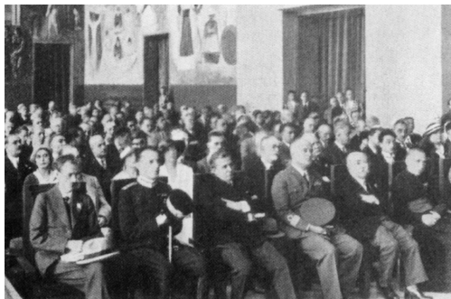
Figure 1: 1 st ICG Congress in Milan, 1933 - opening ceremony

In the early 1930s SGT also established contacts with representatives of the Italian glass industry. The situation of a relatively large international group with mutual personal and professional contacts naturally led to the idea of holding a meeting of all the currently cooperating countries and to invite participants from other countries who might be interested in attending such an event.