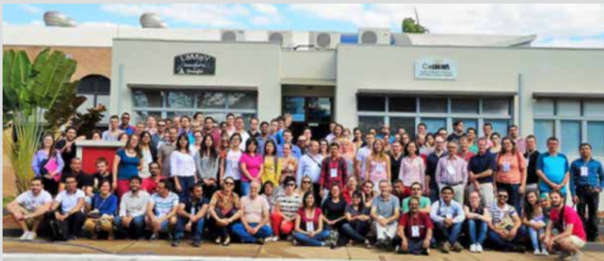
Students and lecturers from the São Paulo Advanced School on Glasses and Glass-Ceramics in front of the Laboratory of Vitreous Materials at the Federal University of São Carlos in Brazil.