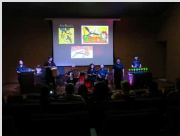
The experimental "glass orchestra" of the Federal University of São Carlos in Brazil playing an opening show in December 2016.

demonstrations of properties and curiosities associated with vitreous materials, including light transmission by optical fiber, glass coloring by doping, acoustic properties, and photosensitive and flexible glasses. The interactive exhibition was presented at numerous major cultural events, reaching out to an audience of ~30,000 attendees.