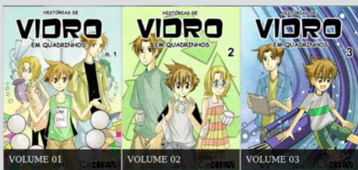
Covers of the first three volumes of Vidro, a series of comic books about glass.

During these first four years, we have consolidated a coherent collaborative research program dealing with fundamental research and development of new materials with technologically interesting properties, covering the full range of timely and potential application areas for glasses and glass-ceramics. Collaboration with partners in industry and extensive promotion of CeRTEV's research findings into marketable products is an integral part of our agenda, which also includes develop-