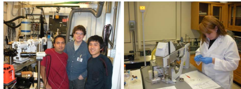
Graduate and undergraduate students conduct research at both Argonne National Lab and Ohio University.