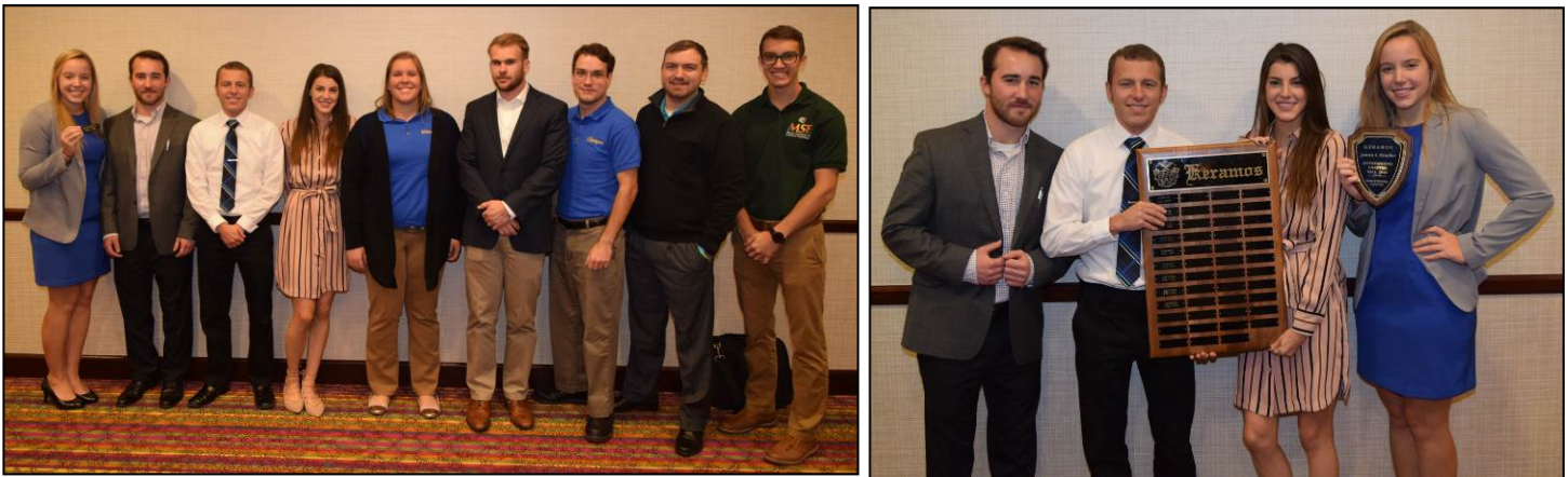
Delegates of the Penn State University and Missouri S&T chapters (left) receive Diamond Awards for Exemplary Achievement by a Chapter while Delegates of the Penn State University Chapter (right) receive the 2016 Outstanding Chapter Award