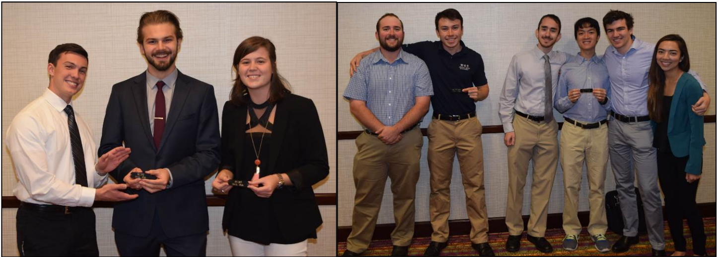
Delegates of the Alfred University and Clemson University chapters (left) receive 2016 Ruby Awards for Achievement by a Chapter while delegates of the University of Arizona and University of Illinois chapters (right) receive Sapphire Awards for High Achievement by a Chapter