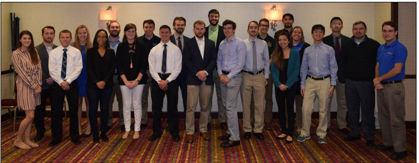
Student delegates at the 2016 Keramos Convocation and Business Meeting in Salt Lake City