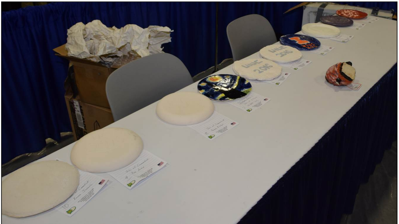
Entries in the 2016 Keramos Ceramic Disc Golf competition