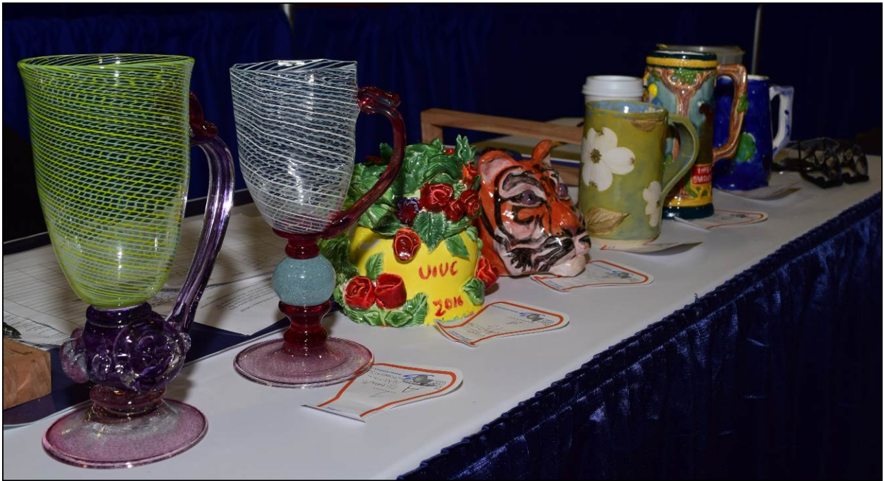
Entries in the 2016 Keramos Ceramic Mug Drop competition