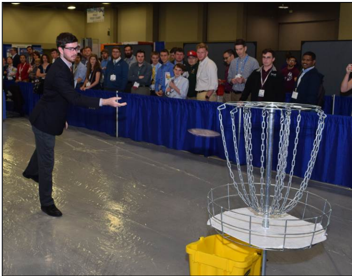
Ceramic Disc Golf competition photos