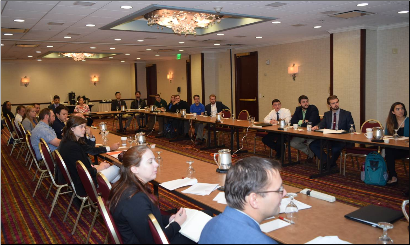
Students and Chapter Advisors at the 2016 Keramos Convocation in Salt Lake City